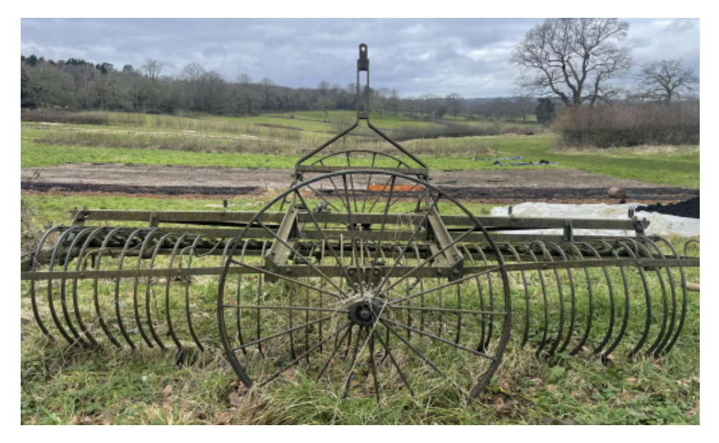
Lot 486 - *Vintage hay rake on large iron spoke wheels